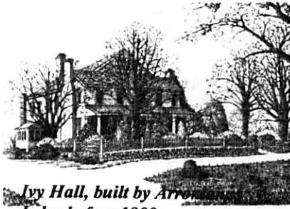
Ivy Hall, built by Arromanus Lyles before 1800